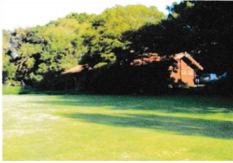
Campsite at 2nd Guernsey Scout Group HQ