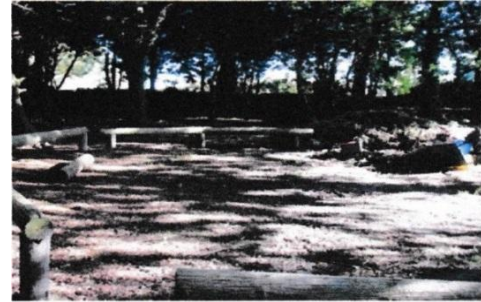
Campfire circle at 2nd Guernsey Scout Group HQ